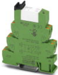
PLC-INTERFACE, hybrid solid-state relay incl. bypass relay with push-in connection, for mounting on NS 35/7,5 DIN rail, input: 24 V DC, output: 24 V AC - 253 V AC/10 A

Please be informed that the data shown in this PDF Document is generated from our Online Catalog. Please find the complete data in the user's documentation. Our General Terms of Use for Downloads are valid ( http://phoenixcontact.com/download )